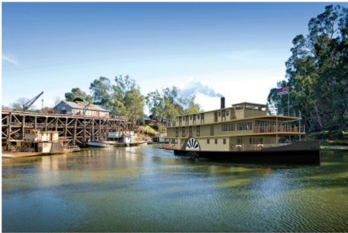
Render of the PS Australian Star due to launch in June 2025

Set to launch in June 2025, the PS Australian Star will be the world's only wood-fired paddlesteamer performing multi-day cruises, and is currently under construction in Mildura, Vic.