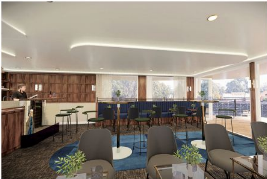
PS Australian Star's Hopwood Lounge and Bar

"As the PS Australian Star prepares to grace the waters, it beckons you to join a voyage where tradition meets modernity, and luxury becomes an art form."