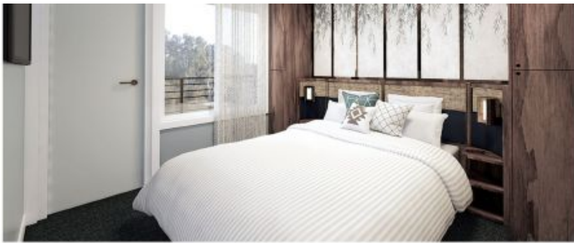
Queen Stateroom on the PS Australian Star

Named in honour of the iconic Southern Cross constellation, this new paddlesteamer features 19 plush and modern staterooms, each opening to a deck and featuring an ensuite, air conditioning, complimentary wi-fi, luxury linen and a TV entertainment system, as well as the beautiful and ever-changing views.